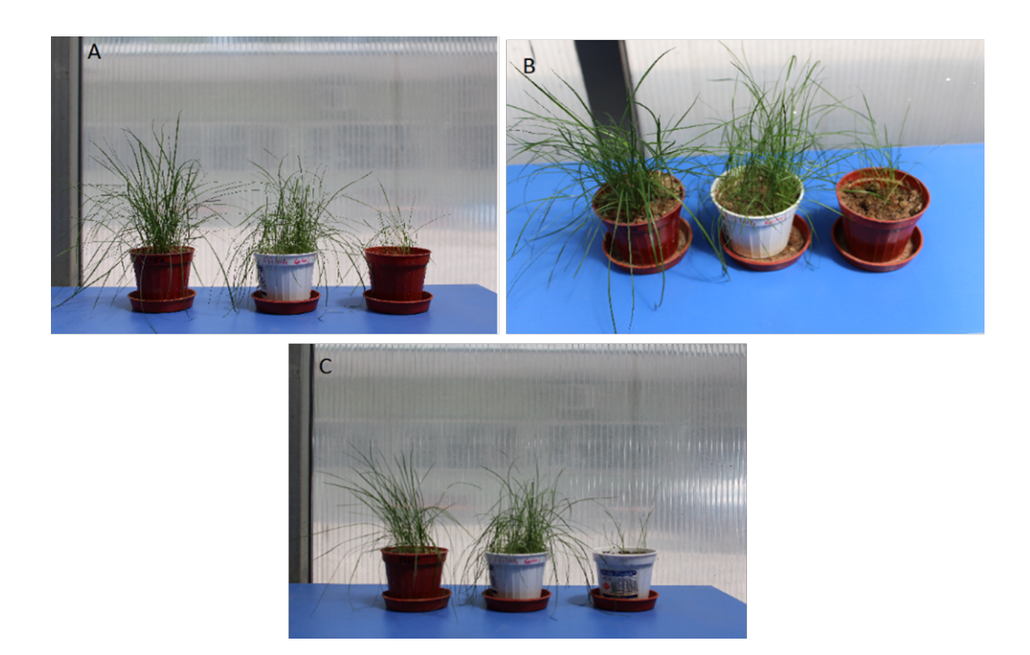
Figure 1. Effects of bacterial isolates against brown patch causing Rhizoctonia solani in greenhouse experiments. A: B. cereus 235e, B: Bacillus sp. 187c, C: Pseudomonas putida 166fp

According to result given in Table 1, the highest protection effect was shown by B. cereus isolate 253e (91.43%). This isolate was followed by the isolates Bacillus sp. 187c (87.62%) and Pseudomonas putida 166fp (81.59%) (Figure 2). In this study, it was also observed that P. putida 166fp strain increased plant growth in grass plants (Figure 3).