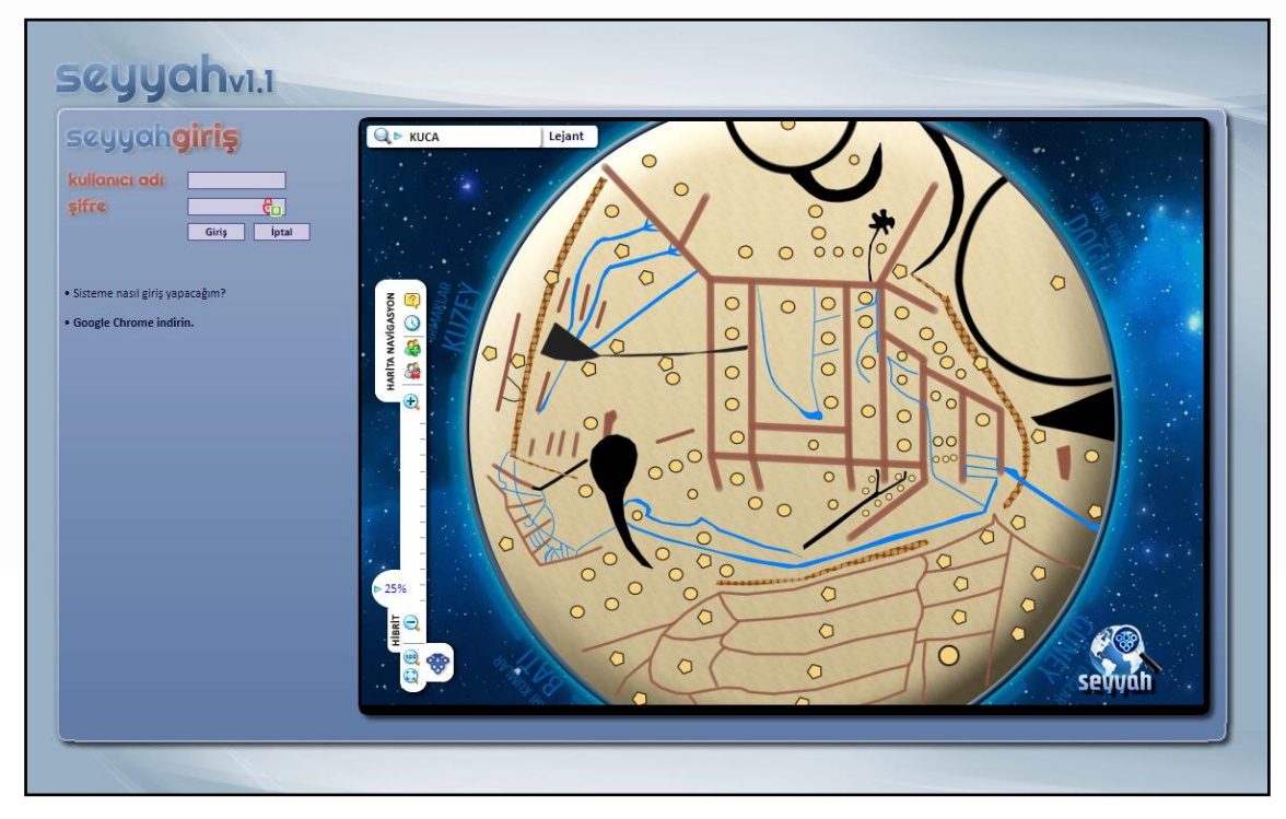
Figure 1. Seyyah v1.1 screenshot