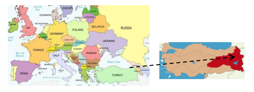
Figure 1 Turkey in Europe and Eastern Anatolia in Turkey

Besides the other targets, Tourism Strategy of Turkey-2023 (TST) (Turkish Ministry of Culture and Tourism, 2007a) intends to increase the competitiveness of tourism sector through creation of regional tourism brands and diversification of tourism products and destinations. Eastern Anatolia is one of