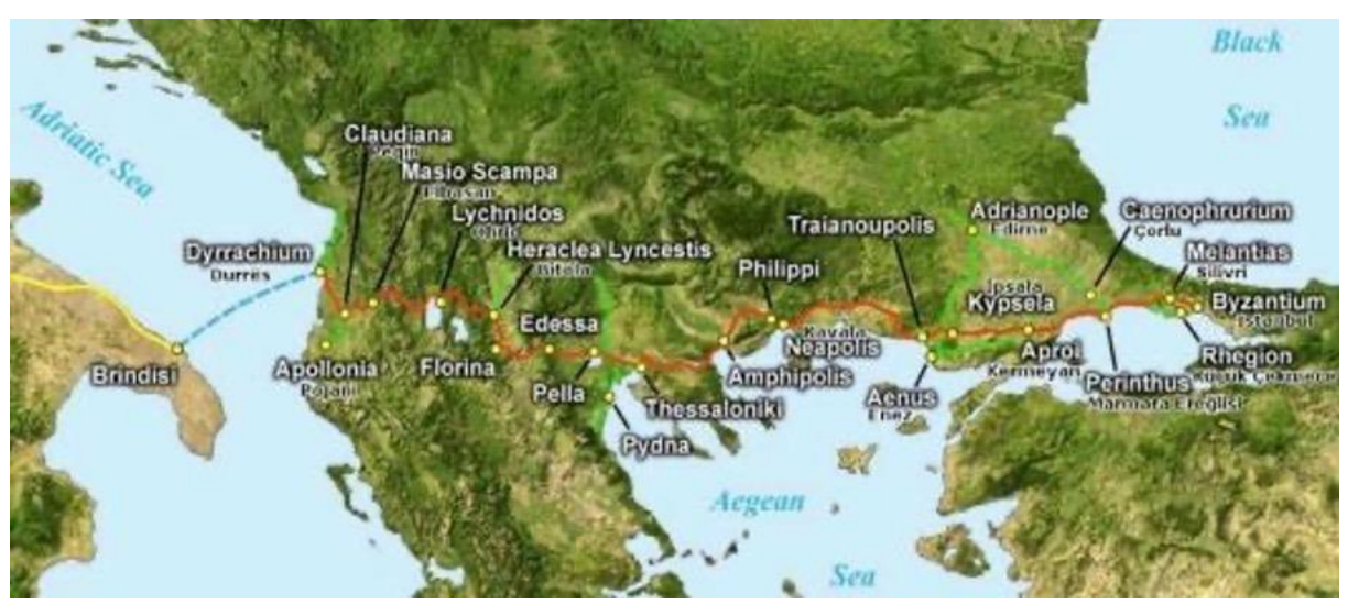
Figure 1. The Via Egnatia beside the Adriatic Sea, reaching Durras from Istanbul (Viaeurasia, 2023)

Protection of the collections in cultural heritage buildings is as important as protection of cultural heritage itself (Tarım & Ünal, 2022). Buildings are architectural values that constitute cultural identity and urban memory. Buildings and other cultural values shape the historical fabric and constitute cultural heritage (Temur & Kurak Açıcı, 2022). The subject of this study, Zeytinburnu Mosaics, are the floor mosaics that were revealed during the excavations between 2017 and 2020 in the vicinity of the former Municipality Building of Zeytinburnu. The mentioned mosaic patterns were discovered in the foundation blocks of the main part of the municipality building so-named 'Mayor Building' and around the area used as carpark. The discovery was made during the restoration implementations of the municipality building in 2015. The patterns were located very close to the Via Egnatia (Figure 1).