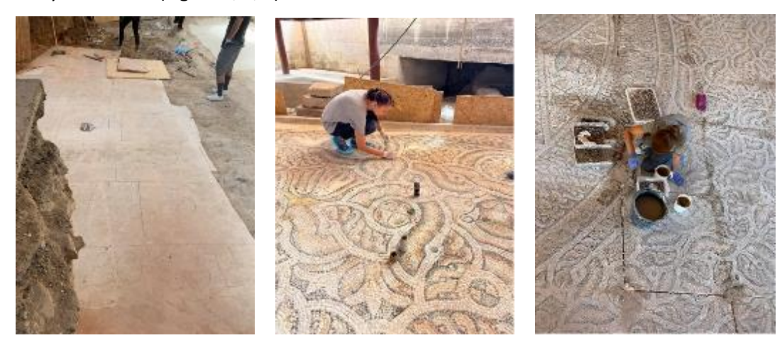
Figure 3. Conservation steps of Zeytinburnu Mosaics

of the conservation report of the Directorate Central and Regional Restoration and Conservation Laboratory of Istanbul (Figure 3, 4, 5).