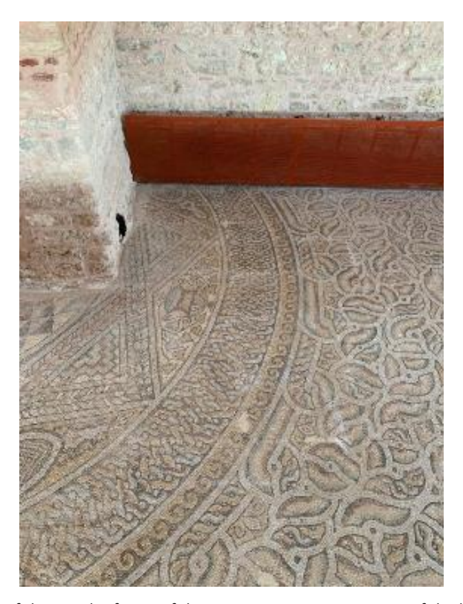
Figure 12. Exhibition of the circular forms of the mosaics at semi-open part of the building (the exterior exhibition part)