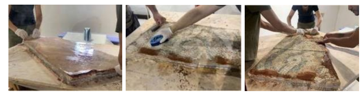
Figure 5. Conservation steps of Zeytinburnu Mosaics