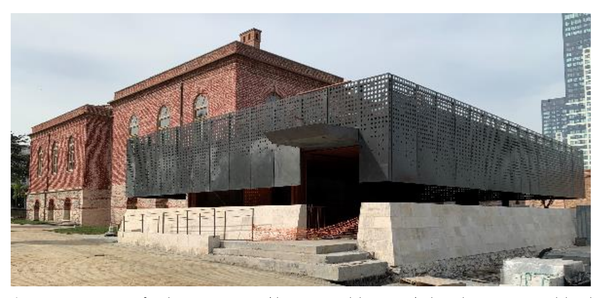
Figure 10. Current view of Kazlıçeşme Art Center (the exterior exhibition part) where the mosaics are exhibited