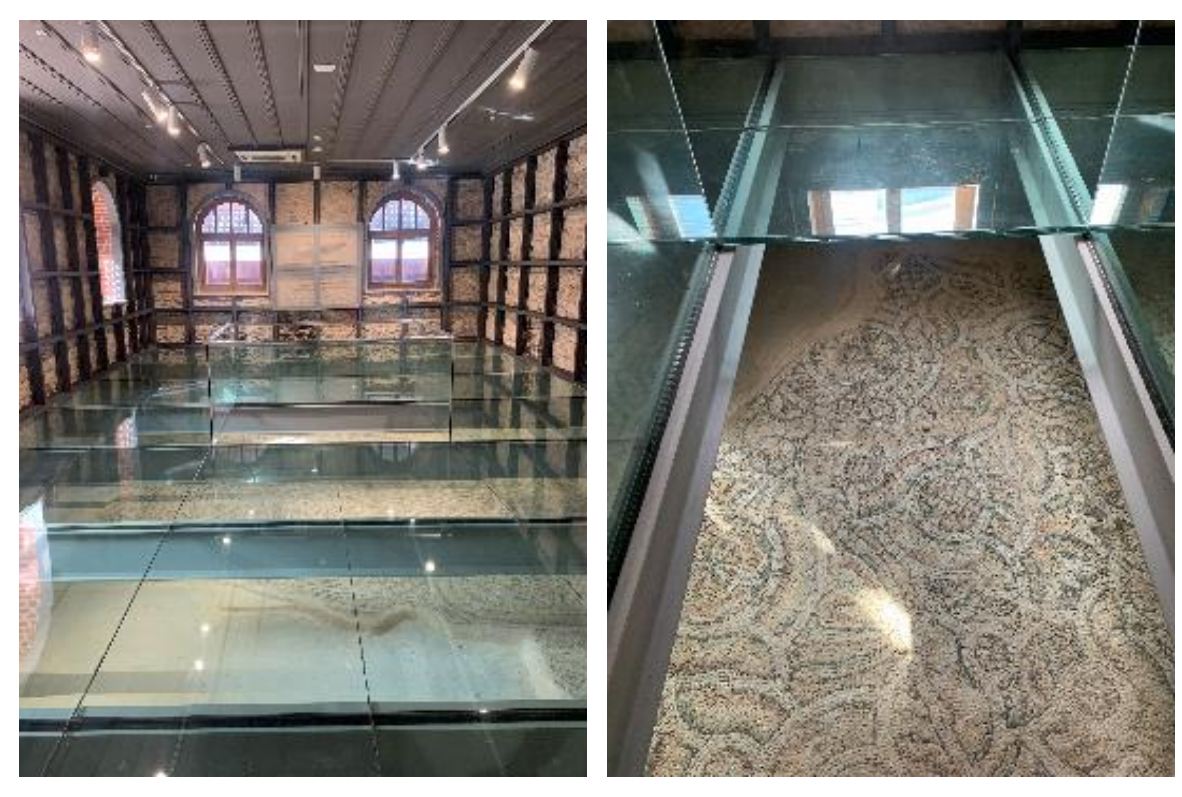
Figure 8. The completed and exhibited part of the mosaics