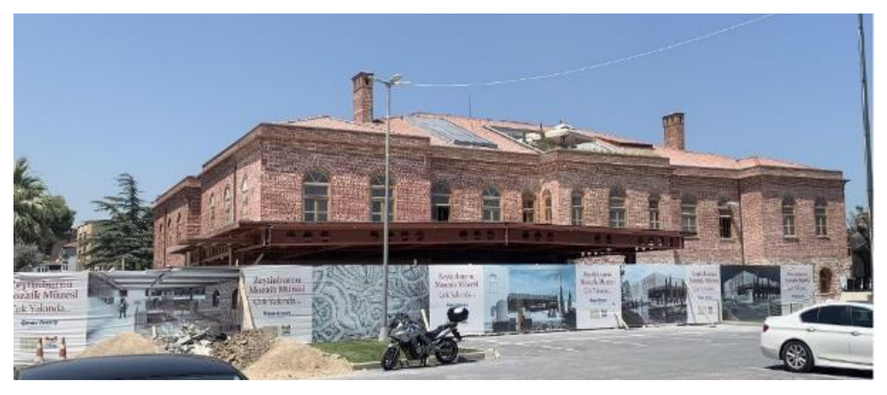
Figure 9. Exterior exhibition works of mosaics at Kazlıçeşme Art Center

After completion of the excavations, the cleaning and conservation works were carried out and the mosaics were replaced for the exhibition and that part of the building was arranged as a museum (Figure 10, 11).