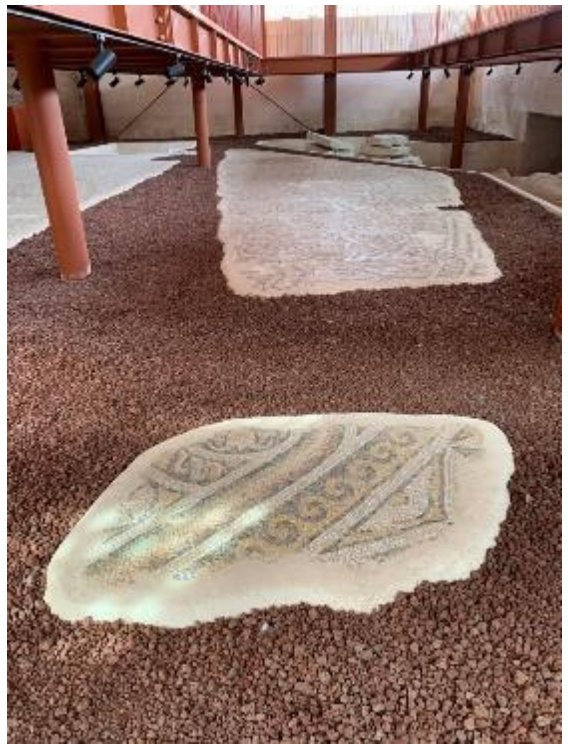
Figure 11. Exhibition of the rest of the mosaics at semi-open part of the building (the exterior exhibition part)