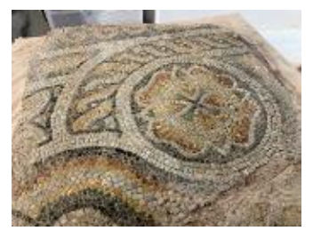
Figure 7. View of vivid colored tessera modules after the cleaning (Zeytinburnu Municipality Archives, 2022)