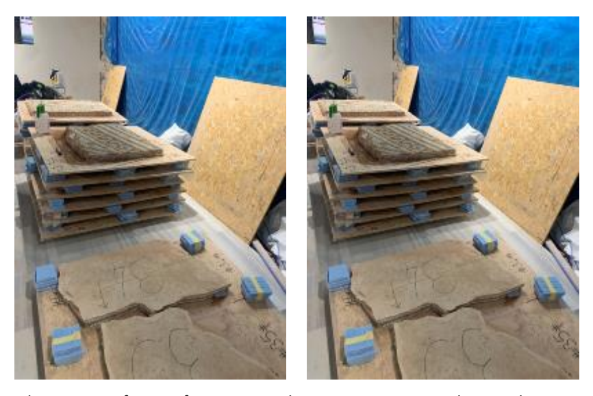
Figure 4. Moving the mosaics after reinforcement and numeration to store them under protection during the conservation implementations (Olcay Aydemir Archives, 2019)