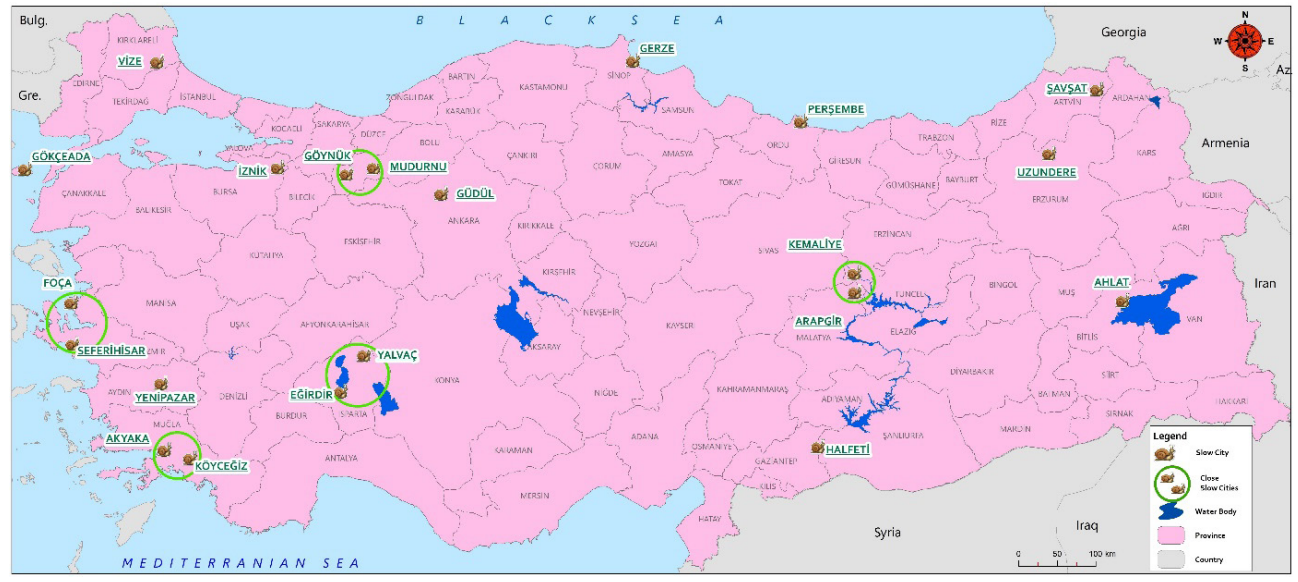
Figure 1. Slow Cities of Turkey

Within and beyond Türkiye are some slow cities that host a number of tourists way in excess of their capacity. Although experts do not find this proper, the administrators of the related destinations have seen and introduced this as a sign of success. Ekincek's (2014) study understood Cittaslow city administrators